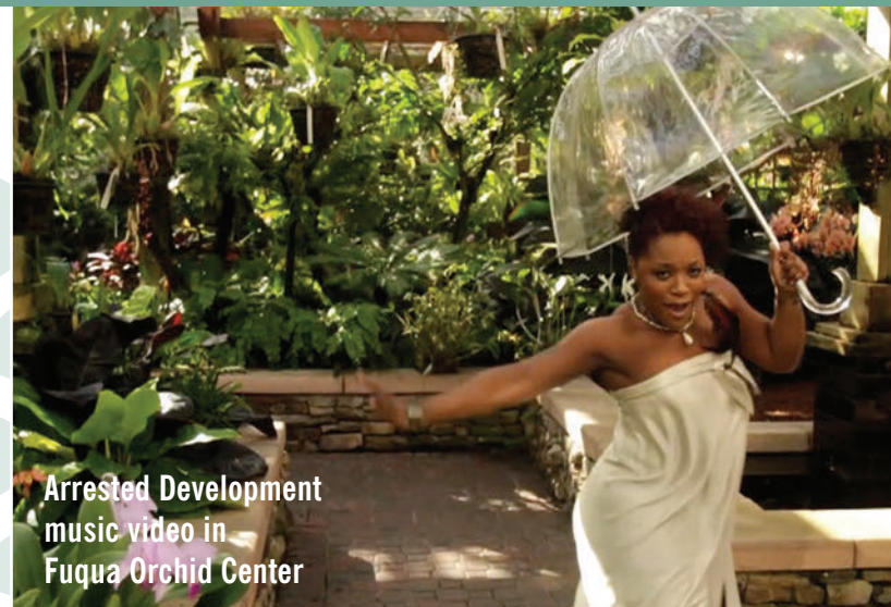
Arrested Development music video in Fuqua Orchid Center