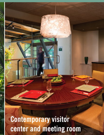
Contemporary visitor center and meeting room