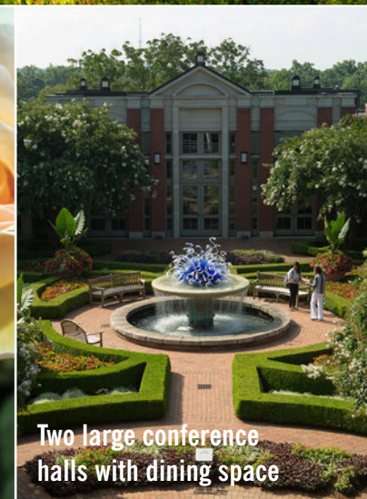
Two large conference halls with dining space