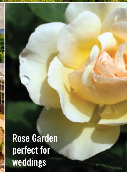
Rose Garden perfect for weddings