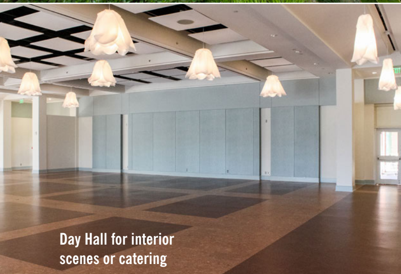
Day Hall for interior scenes or catering