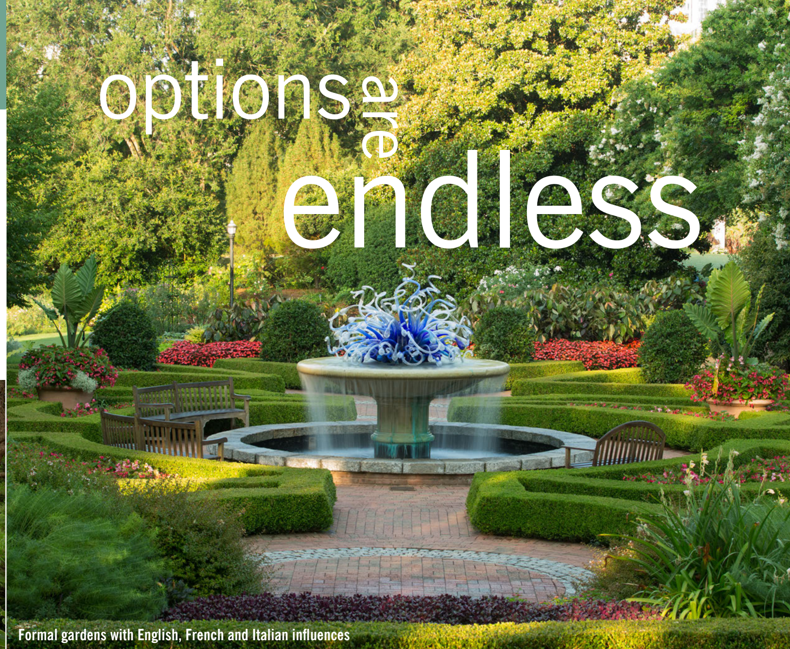
Formal gardens with English, French and Italian influences