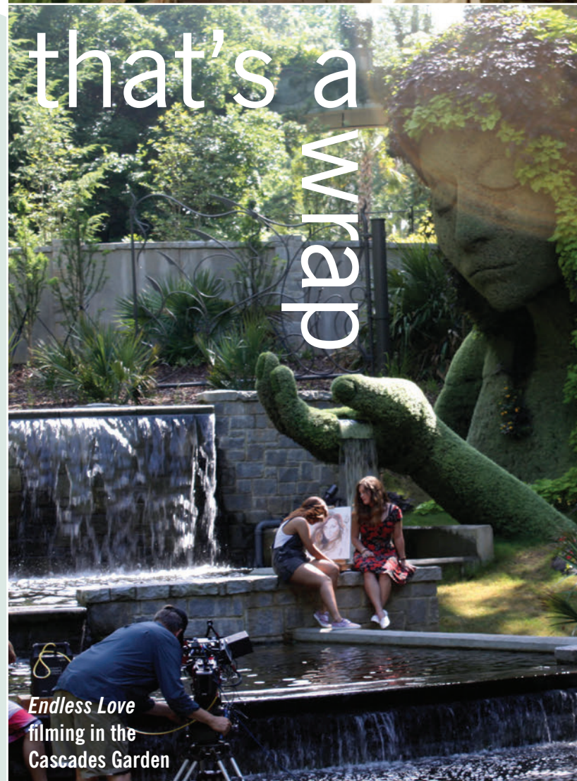
Endless Love filming in the Cascades Garden