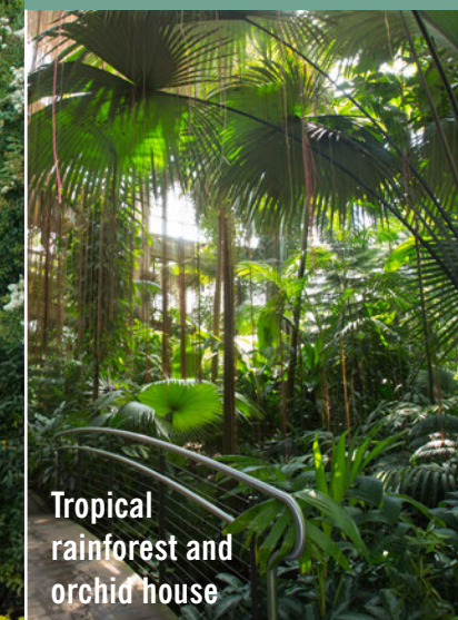
Tropical rainforest and orchid house