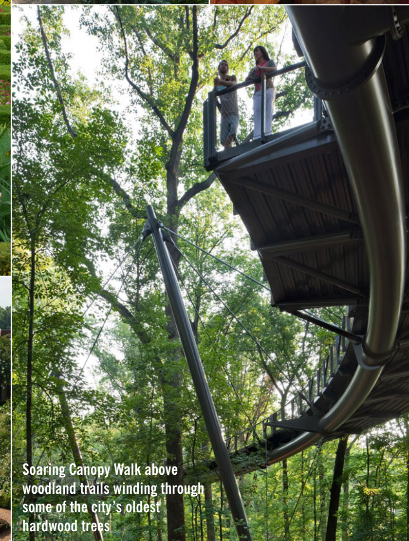
Soaring Canopy Walk above woodland trails winding through some of the city's oldest hardwood trees