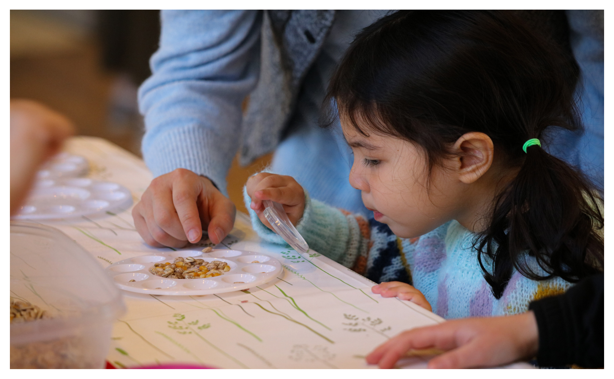
Visit the Children's Garden to plant some spring seeds to take home. Kids will also get the opportunity to explore seeds up close with some seed sorting activities!