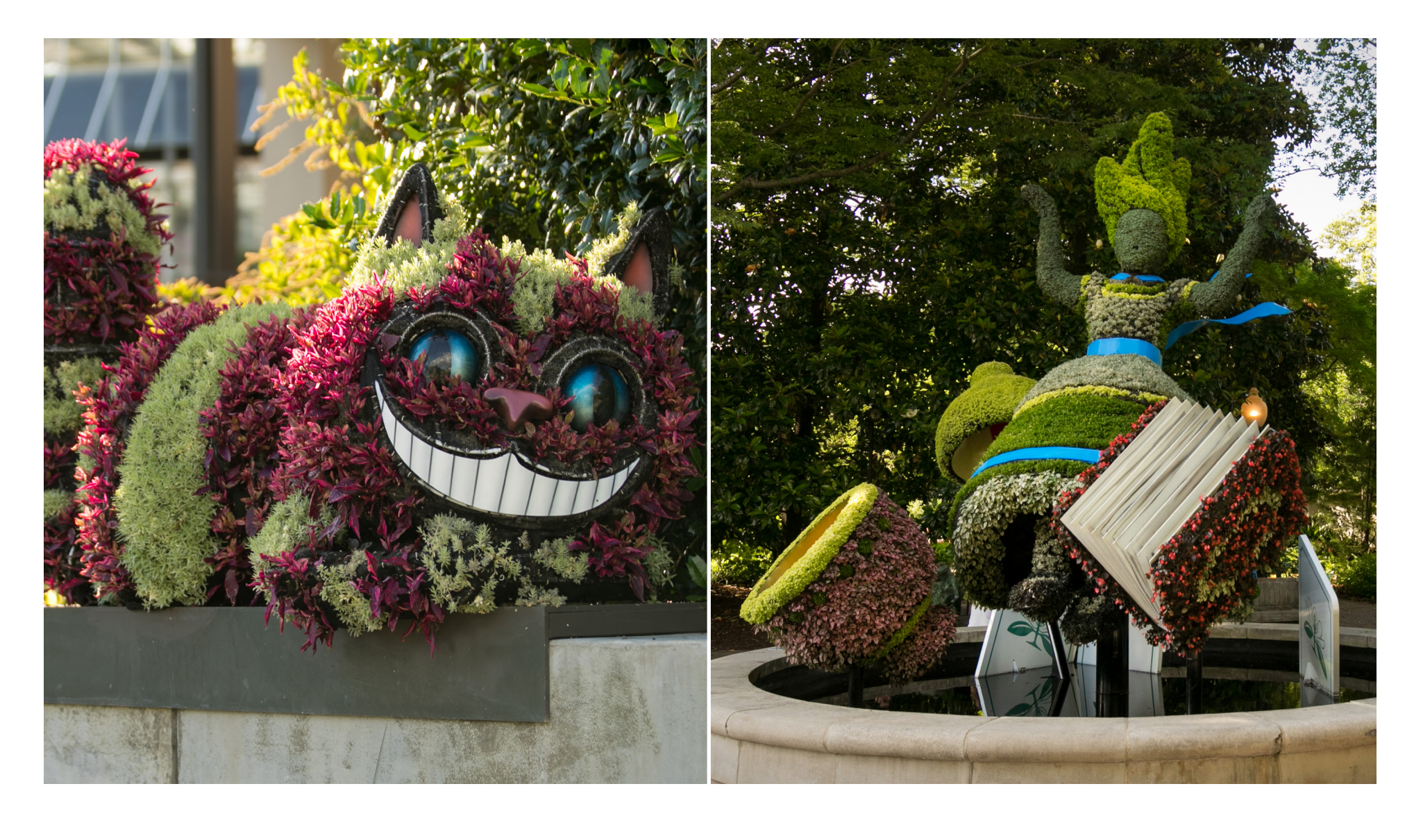
Alice's Wonderland Returns , set for May 11 – September 15, features seven installations of mosaiculture pieces throughout the Garden. Look for a towering Alice twirling in Howell Fountain, the giant White Rabbit holding court in the Skyline Garden pond, and more!