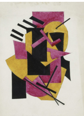
Image 5: 31" w x 46.9" h Suprematist Design (Decorative Motif) by Olga Rozanova