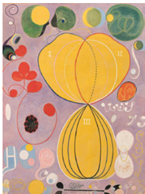
Image 1: 33.2" w x 44.6" h Group IV, No. 7. The Ten Largest, Adulthood by Hilma af Klint

(Images also may be viewed when registering online)