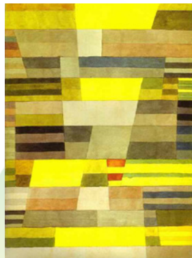
Image 6: 31.2" w x 46" h (KLEE) Monument in Fertile Land by Paul Klee