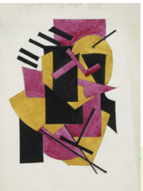
Image 5: 31" w x 46.9" h Suprematist Design (Decorative Motif) by Olga Rozanova