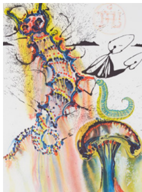
Image 3: 33.2" w x 45.2" h Advice from Caterpillar by Salvador Dali