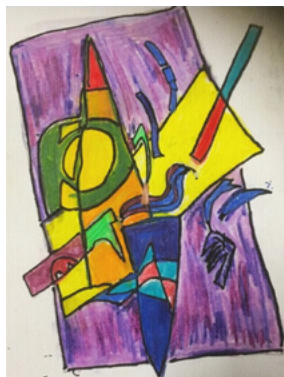
Image 4: 33.2" w x 44.2" h The Bird Has Flown by Kathryn Borrow (Kattrend)